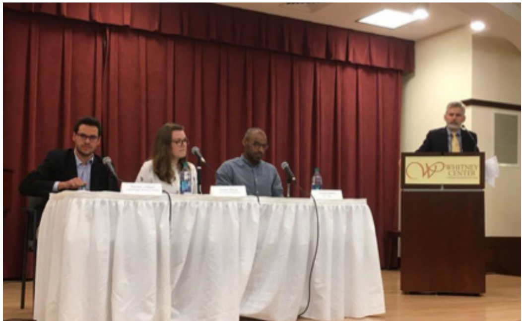
Fox Fellows at the annual Whitney Center's Cultural Art Center, who presented on their work, which aims to achieve international resolutions to some of the world's most pressing issues.