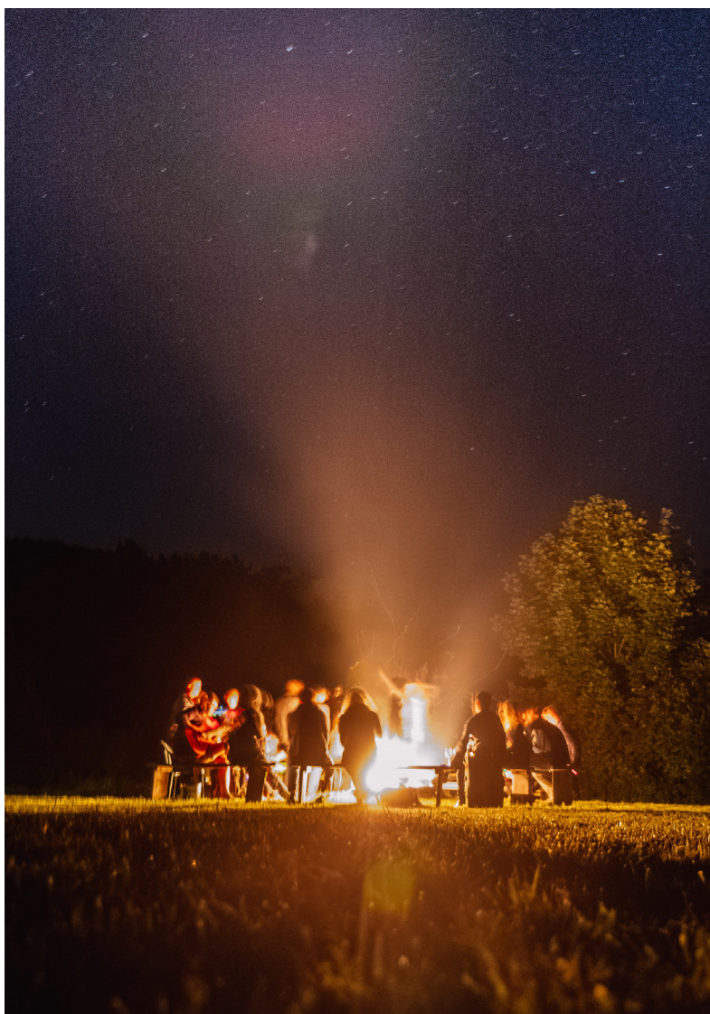
The Fox Fellows gather around the campfire at the Yale Great Mountain Forest, Norfolk, Connecticut.

After years of experimenting with different training methods, the Fellowship entered a formal collaboration in 2017 with the Scholar Strategy Network (SSN) , a U.S. organization devoted to connecting academic and policy worlds. The SSN connects scholars and their research to policymakers, citizens' associations, and the media. One of its core contributions to academic training are efforts at policy briefs designed to give policymakers and activists a quick review of relevant research. The goal of the Fox Policy Brief training is to elaborate and emphasize the practical implications of the Fox Fellows' research for policymakers and the public.