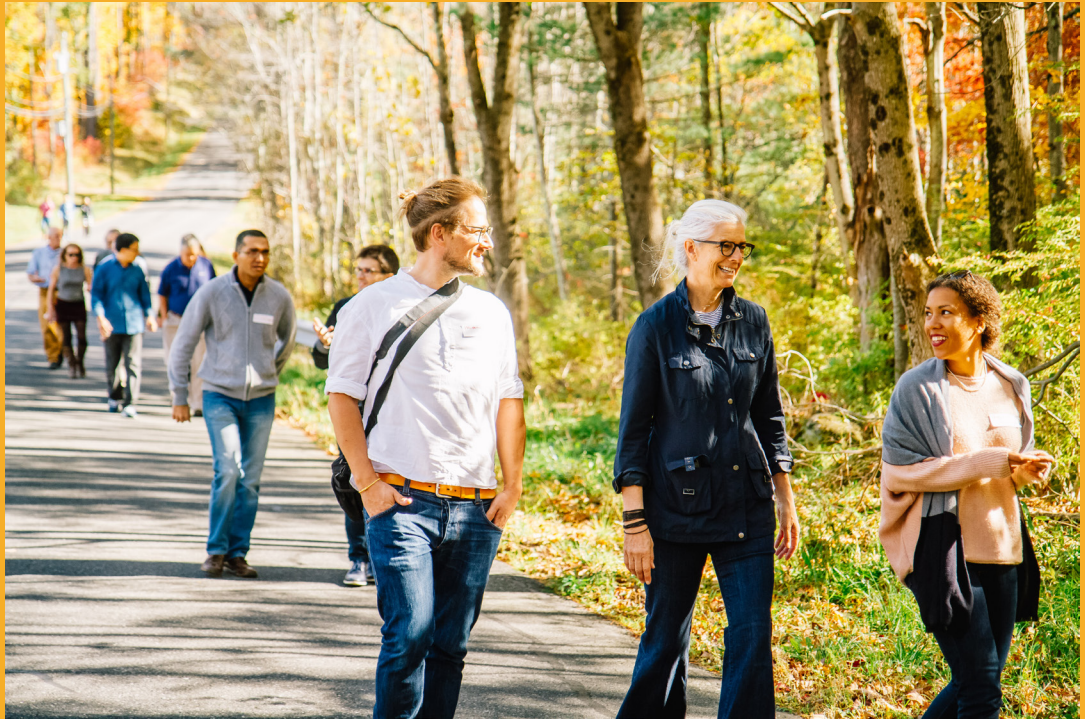
A beautiful fall day in Norfolk, Connecticut