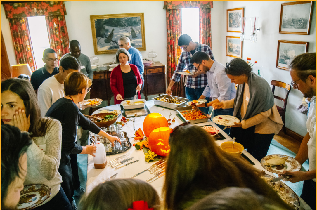
Early Thanksgiving luncheon at the Fox house in Norfolk, Connecticut