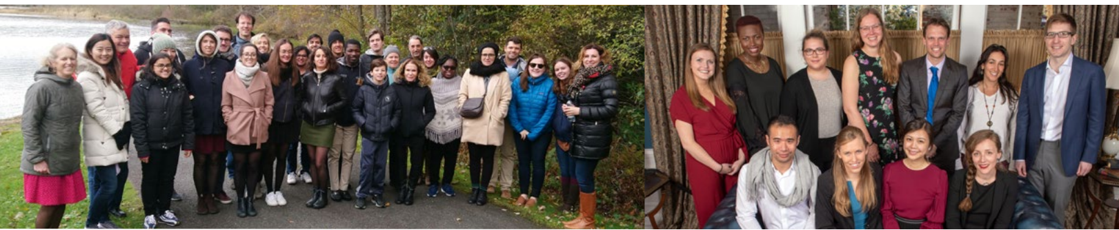
Fox Fellows at Yale Great Mountain Forest retreat.

The Fox Fellows sent to exchange partners had an equally successful year. Many of the Fellows advanced their work by conducting archival research, having conversations with peers and professors at the exchange partner institutions, and observing proceedings in a different environment. As many of these Fellows are only now returning home, we have not yet received their final reports. Further details of their activities will be reported in next Fox International Fellowship annual report .