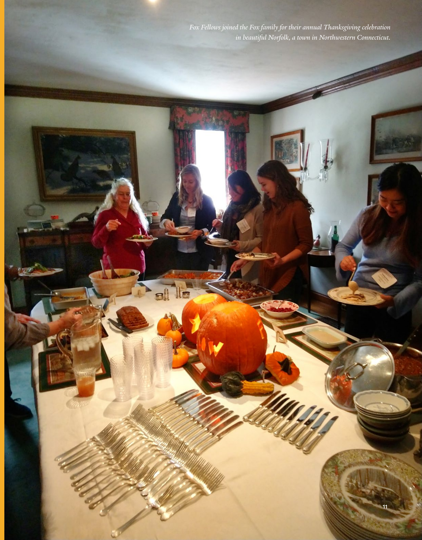
Fox Fellows joined the Fox family for their annual Thanksgiving celebration in beautiful Norfolk, a town in Northwestern Connecticut.