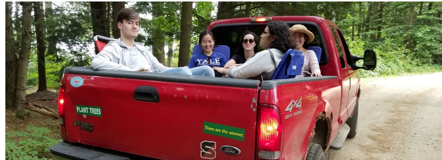
Fox Fellows at Yale Great Mountain Forest retreat.