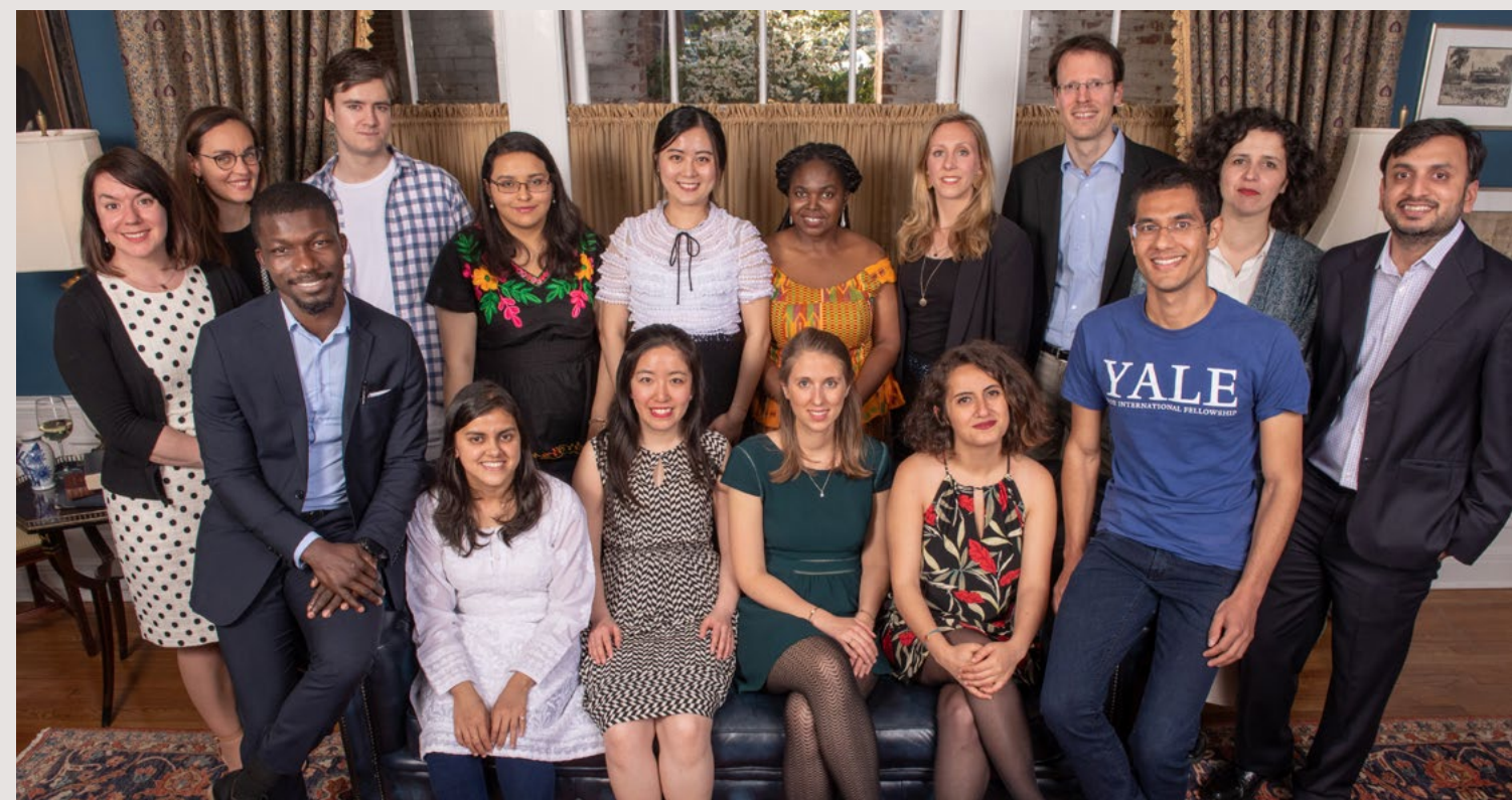
Fox Fellows at Yale Great Mountain Forest retreat.